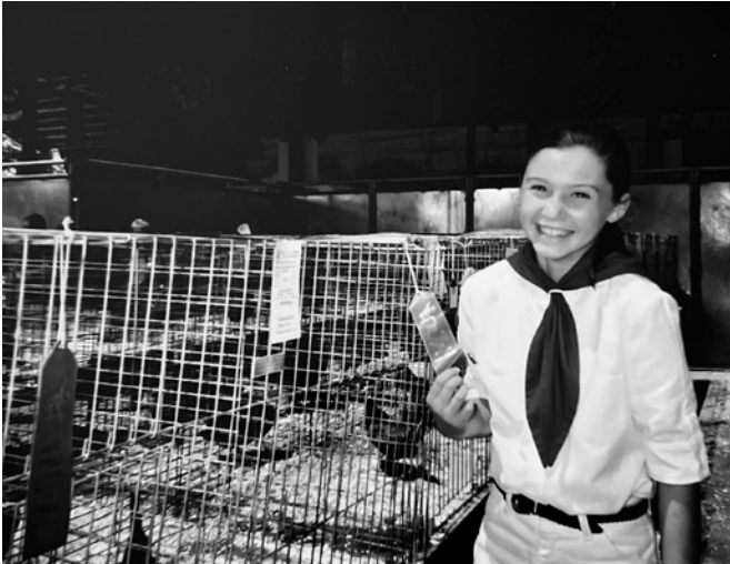
My first poultry show at our local fair (2002)

have to name my first chicken "super chicken." She lived up to the name, both laying eggs and crowing!