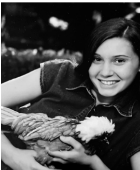
My senior picture (2006).

What breeds do you currently show? What stands out to you, or what do you enjoy about this/these breed(s)? Currently, we show Mille Fleur and Porcelain D'Uccles. We enjoy the temperament of the birds. They are a tricky bird to breed well due to lack of consistency in markings. Once you find a good bird to condition, they are a tough bird to condition. We have to breed for it will show but be calm enough to stay